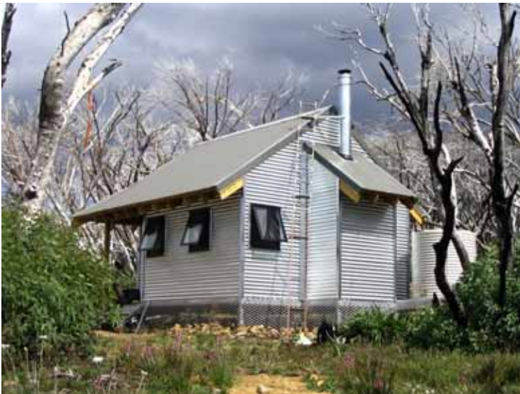
The newly completed Federation Hut December 2004.