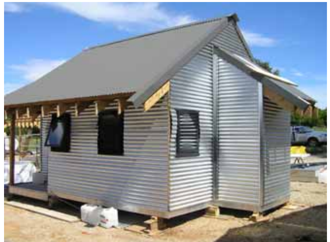
Trial assemblies at Stanley of Federation Hut (left) and Michell Hut (right).