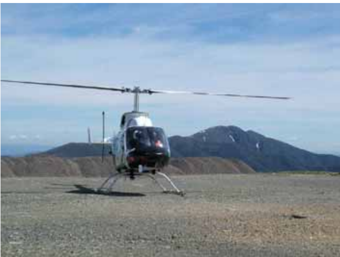
Above: Helicopter at Mt Loch carpark with destination (Mt Feathertop) in background.

Transportation of the hut components to hut sites by helicopter had to wait until early December 2004, when the snow had melted and weather conditions were favourable. In an intense one-day operation, a helicopter was used to airlift the components to the remote hut sites.