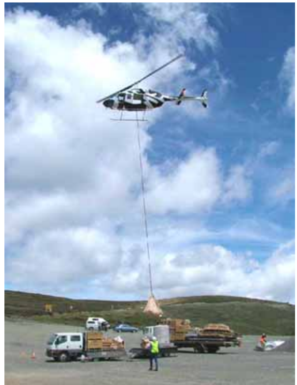
Right: Helicopter loading up with Federation Hut components at Mt Loch carpark.